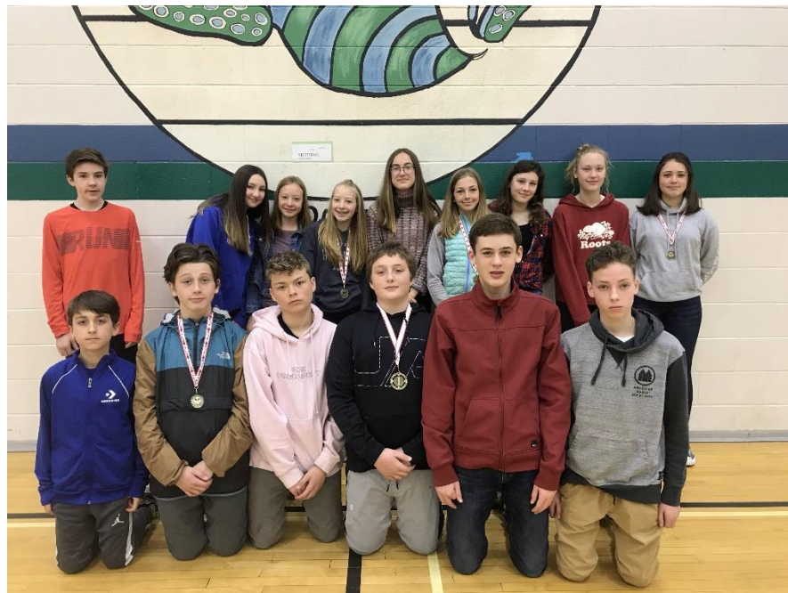
HPS Intermediate Badminton Team